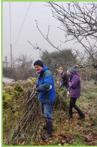
Volunteers cutting back vegetation on the boundary, December 2023