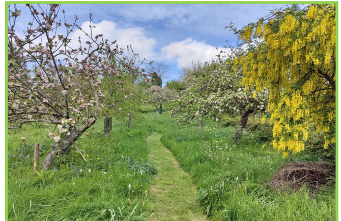
The new circular path through the orchard, April 2024