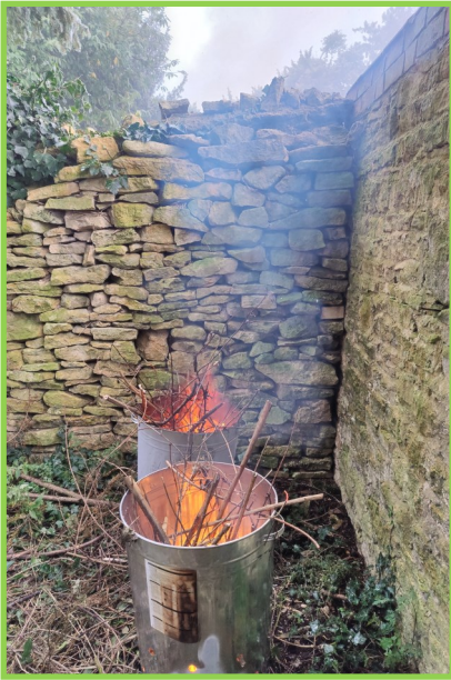
The new incinerator bins in action, December 2023