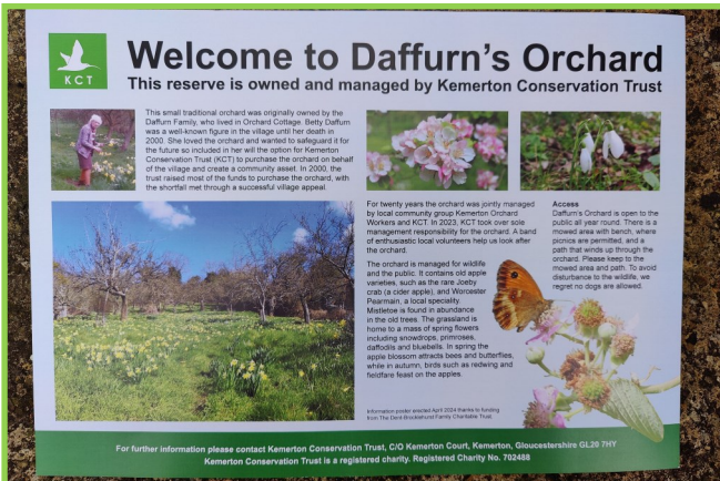
The new A3 information board for Daffurn's Orchard, January 2024