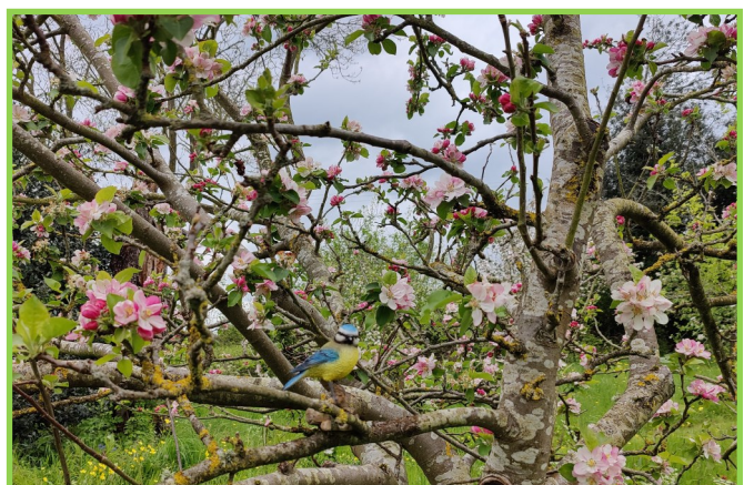
Teetee the Blue Tit in position as part of the nature trail, March 2024